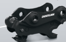
HYDRAULIC QUICK COUPLER